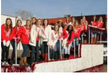
of the festivities such as the AutoZone Liberty Bowl Parade on world famous Beale Street. We have a spot in the parade just for you!!

Date: Monday, December 30, 2019 - AutoZone Liberty Bowl Parade - 3:00 P.M. This is your chance to parade down historic Beale Street in front of a packed crowd of Bowl fans. The Queen's guests will be able to join in the fun watching with other Bowl fans along the Beale Street parade route. After the parade, Queens and their guests can stay on Beale Street and enjoy the music. The DoubleTree Downtown Hotel is just two blocks away from Beale Street (so no transportation is needed to go back to the hotel). You can make your own schedule for dinner and evening activities.